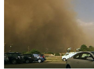
Raw Video: Dust Storm Rolls Through Texas