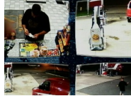
Drunken Dad Allegedly Forces Daughter, 9, to Drive