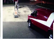
Police: Mich. Man's Daughter, 9, Drives to Store