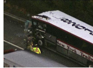
Raw Video: Passenger Bus Crashes in New York