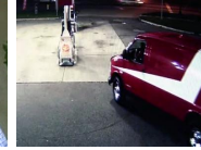
Police: Mich. Man's Daughter, 9, Drives to Store