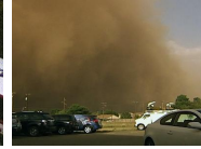
Raw Video: Dust Storm Rolls Through Texas