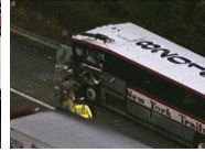
Raw Video: Passenger Bus Crashes in New York