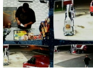
Drunken Dad Allegedly Forces Daughter, 9, to Drive