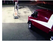
Police: Mich. Man's Daughter, 9, Drives to Store