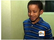
Boston firefighter catches boy after 3-story drop