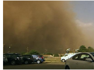
Raw Video: Dust Storm Rolls Through Texas