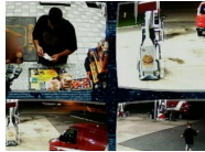
Drunken Dad Allegedly Forces Daughter, 9, to Drive