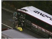
Raw Video: Passenger Bus Crashes in New York