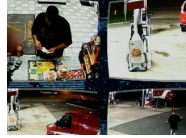
Drunken Dad Allegedly Forces Daughter, 9, to Drive